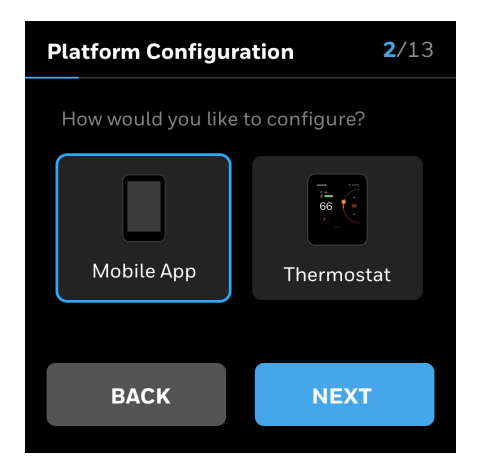
Figure 1. Choose the platform to begin configuration

On the first boot, the thermostat prompts the user to choose the language followed by the mode of initial configuration. You can set up the thermostat through the mobile app or the thermostat interface.