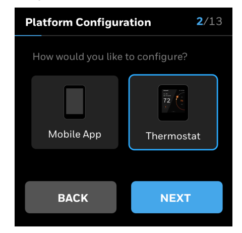
Figure 6. Thermostat configuration

1. After language selection, the Platform Configuration page appears. Tap Thermostat .